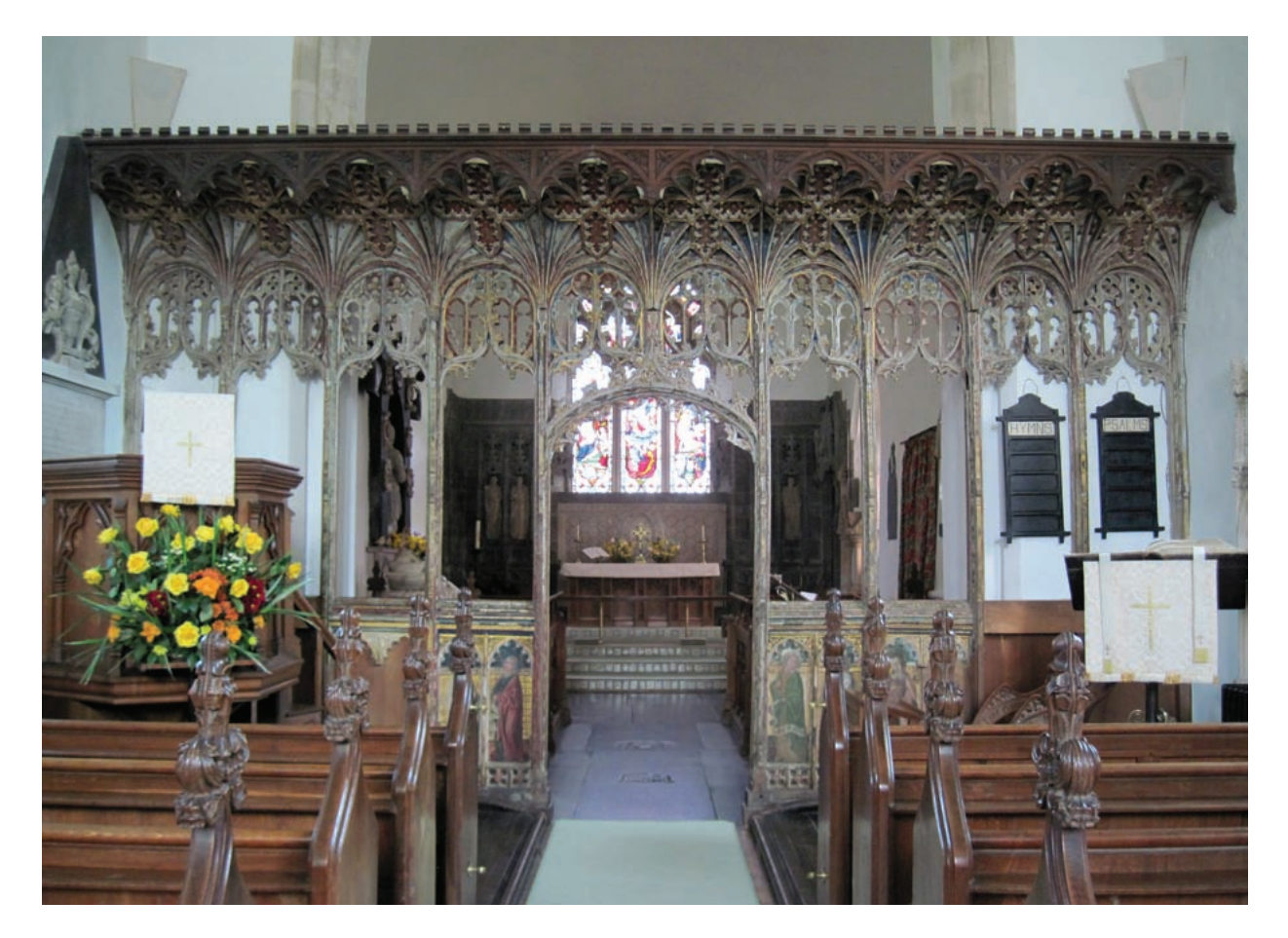
FIG. 77 - Bramfield rood screen.