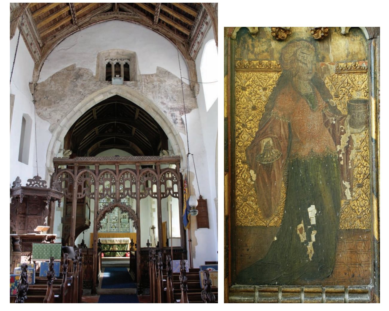
FIG. 85 – The rood screen at Yaxley.