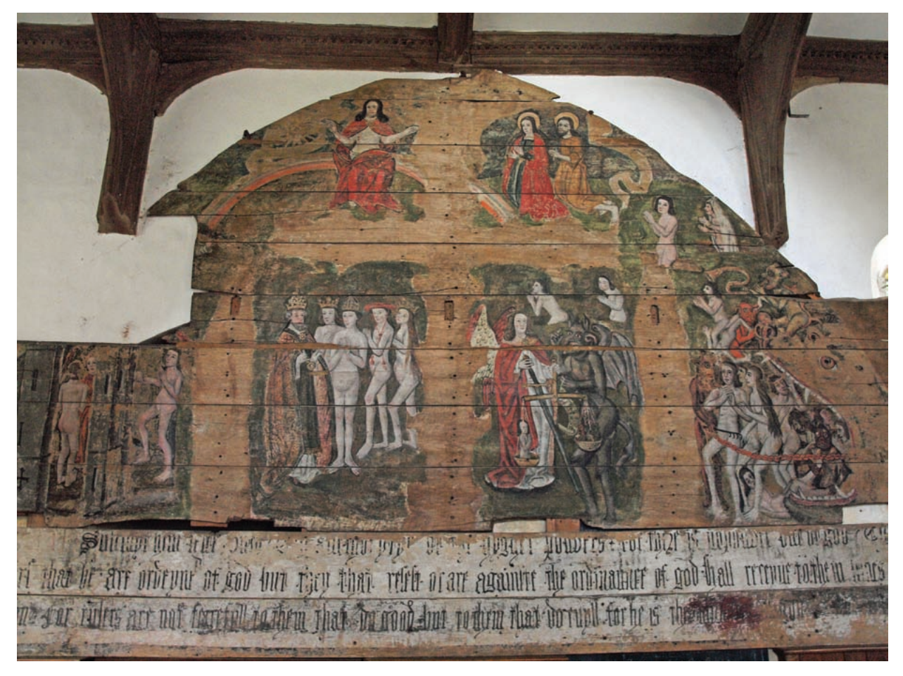
ABOVE: FIG. 83 Originally over the chancel arch, the Wenhaston Doom shows the ghosts of the rood cross and figures.