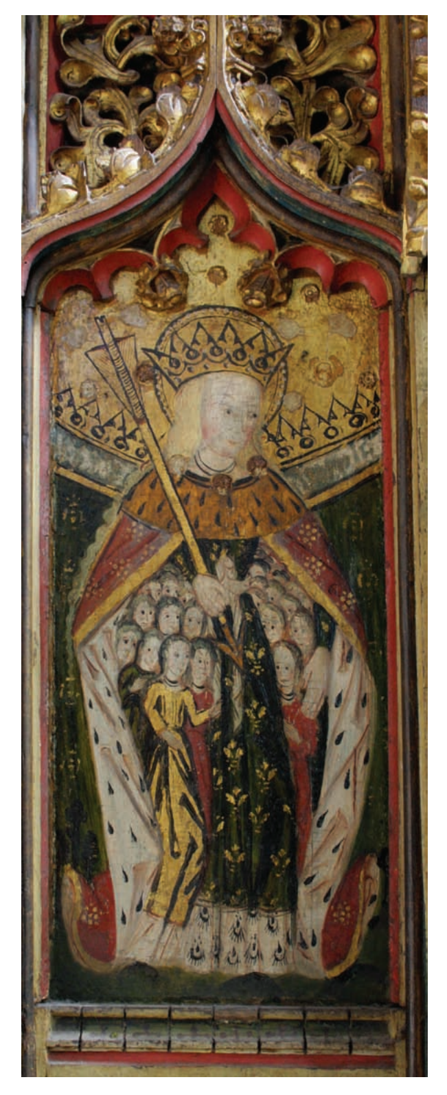
FIG. 80 – St Ursula on the rood screen at Eye.