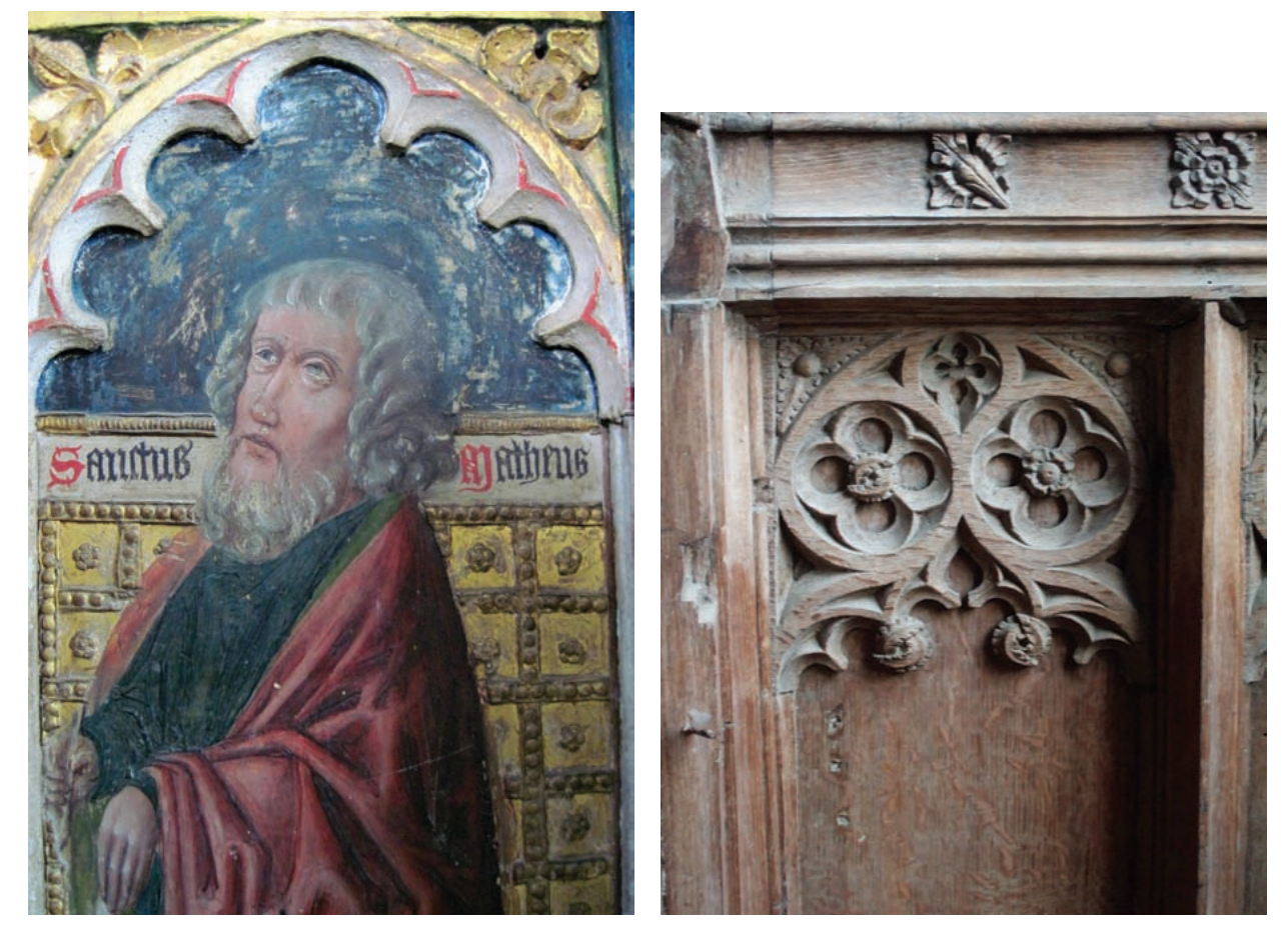
FIG. 78 – Detail of St Matthew, Bramfield rood screen.